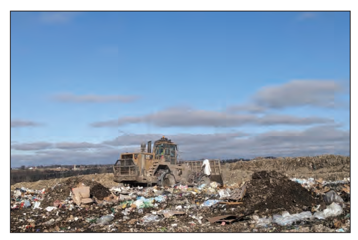
Compactor in Phase 4