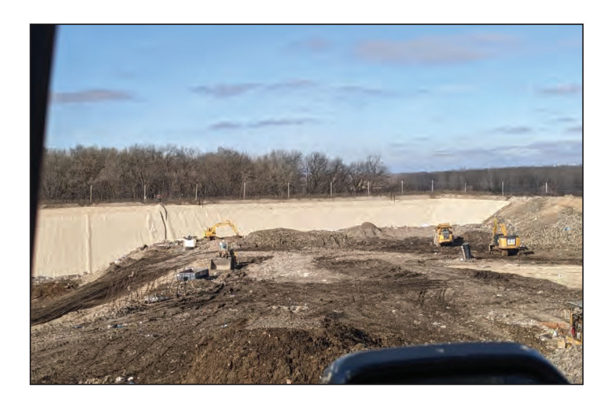
Phase 3 module 2