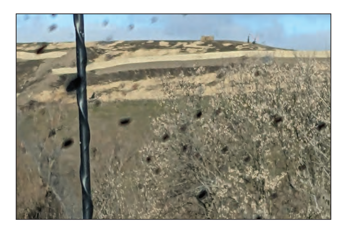
Cap project awaiting seeding and minor erosion repairs