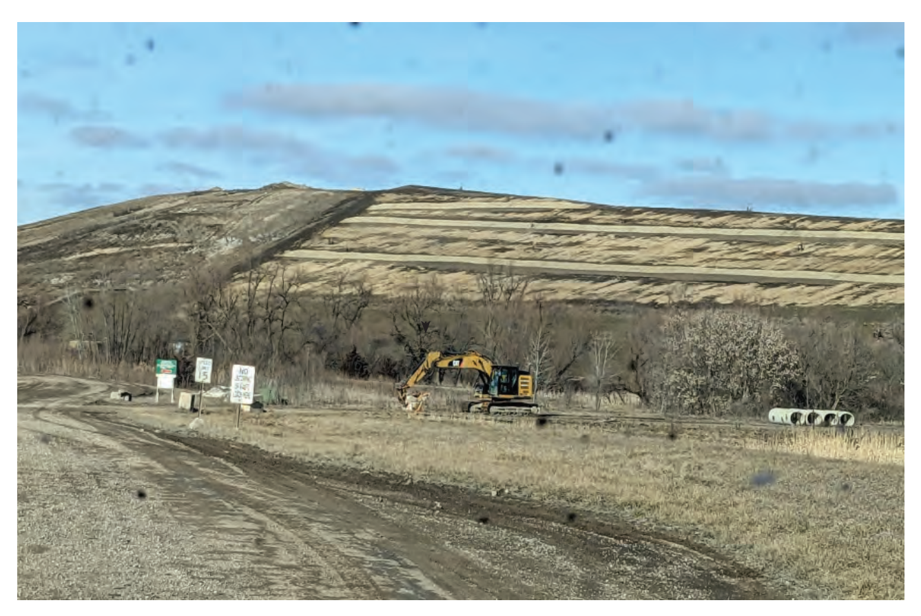
Pheasant Run viewed from the South