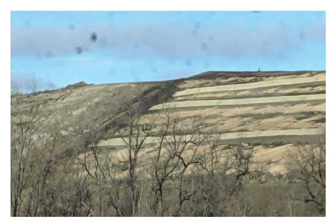
Cap project awaiting seeding and minor erosion repairs