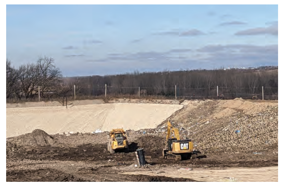
Phase 3 leveled out and stockpiles of cover placed for future waste placement