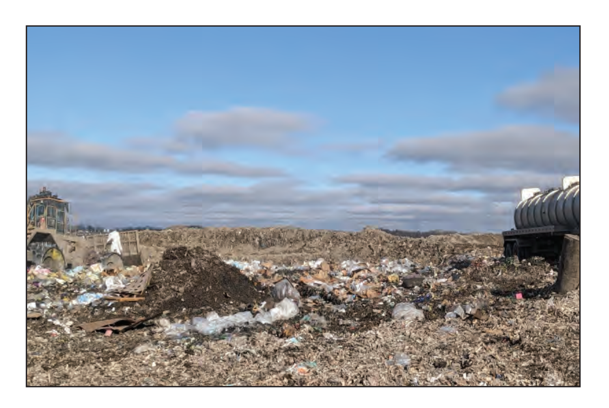
Tipping near working face