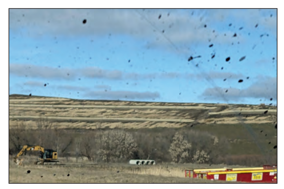
Cap project awaiting seeding and minor erosion repairs