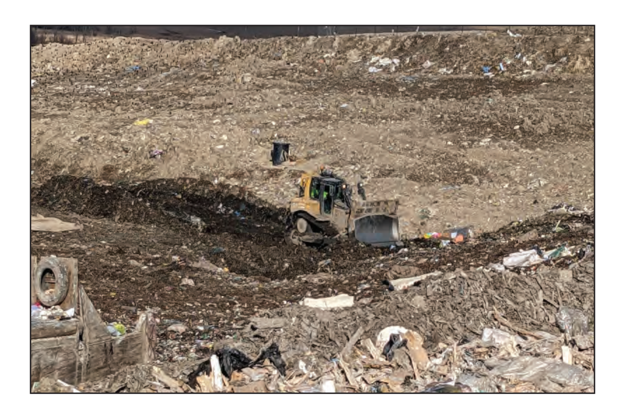
Dozer recovering cover and reshaping active area